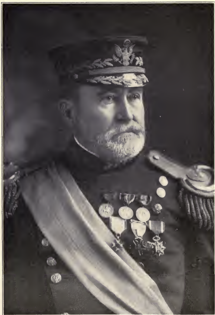
MAJOR-GENERAL FREDERICK D. GRANT